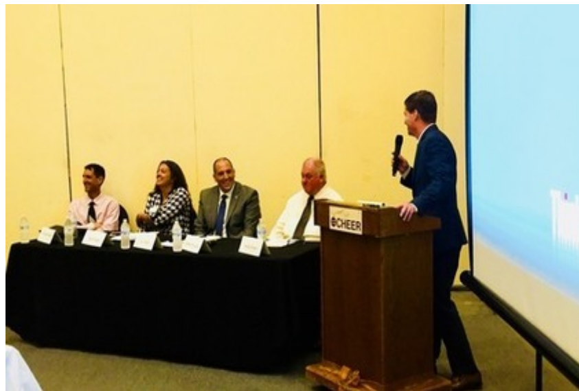
Panel at the Delaware Flood Insurance mini-roundtable.

FEMA identified two major goals to advance the Risk MAP program. The two moonshots, to double the nation's flood insurance policies and to quadruple mitigation investment by 2022, are top of mind.